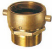
FEMALE SWIVEL X MALE NPT