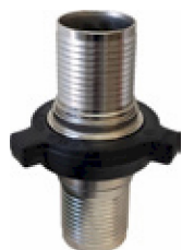
100 FRAC COUPLING

Our hose barb union is constructed of high quality forged steel. The integral hose shank is featured on both the male and female shanks. Both time and money is saved by combining the unions with the integral shanks. No more welding hammer unions to combination nipples. The union end connection is interchangeable with all major hammer union manufacturers products.