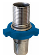
206 FRAC COUPLING