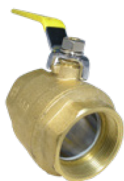
CSA BRASS - FULL PORT