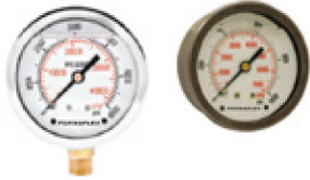
2-1/2" Stainless Steel Liquid Filled Gauge