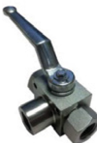
3-WAY HIGH PRESSURE BALL VALVE (SAE THREAD) L PORT