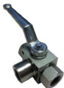
3-WAY HIGH PRESSURE BALL VALVE (NPT THREAD) L PORT