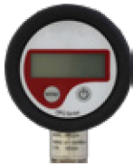
2-½" Digital Pressure Gauge