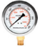
4" Stainless Steel Liquid Filled Gauge