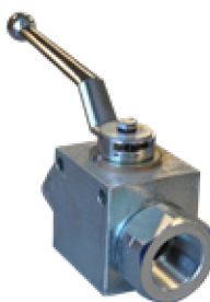
HIGH PRESSURE BALL VALVE (SAE THREAD)