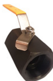
CARBON STEEL - REDUCED PORT