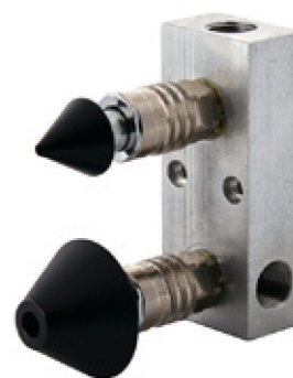
Air Cleaning Systems